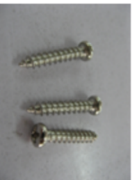
Screw Quantity: 3 Notes: M4x20mm