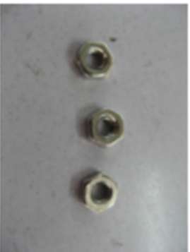
Nut Quantity: 3 Notes: M4