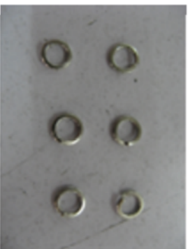
Spring Washer Quantity: 6 Notes: M4