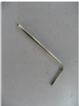
Allen Key Quantity: 1 Notes: Diameter 2mm