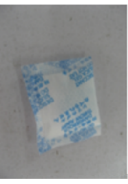
Silica Gel Quantity: 1