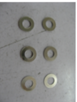
Washer Quantity: 6 Notes: M4