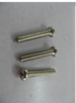
Bolt Quantity: 3 Notes: M4x20mm